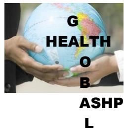
Table 1: Curriculum International Course Global Health